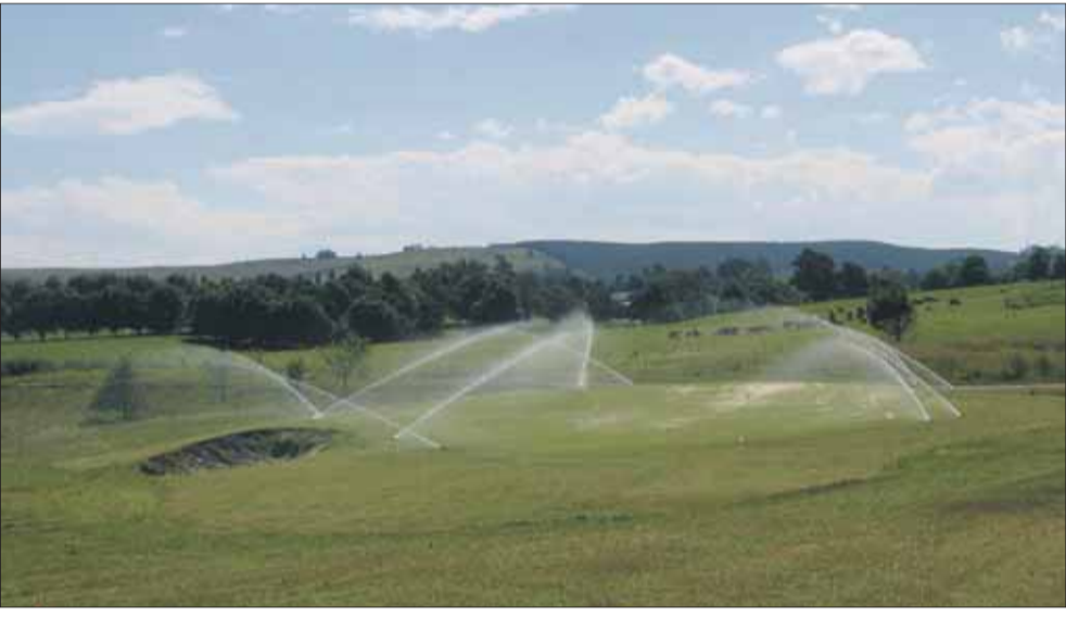
ABOVE: The sprinkler system irrigating the sixth green.