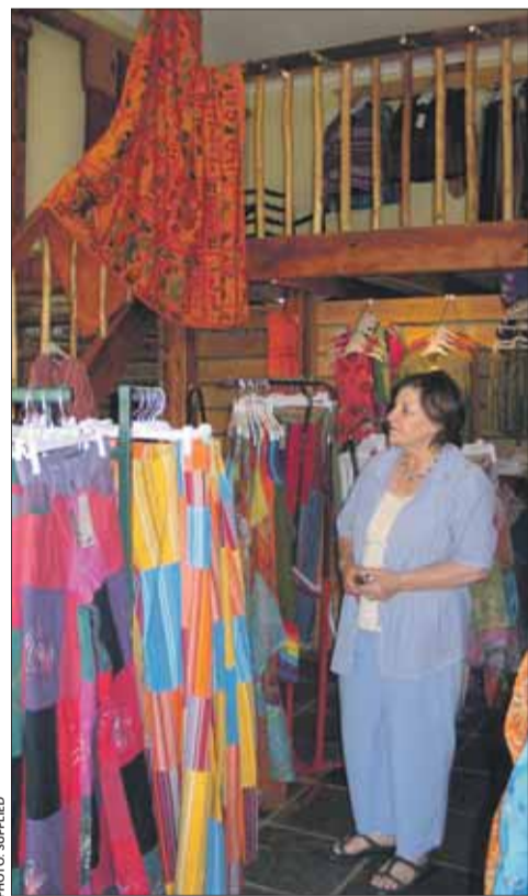
ABOVE: Dirt Road in Gowrie has a new look and unique goods from Nepal, in addition to its selection of outdoor wear and products.

Dirt Road is open seven days a week, from 9am to 5pm. Tel: 033 266-6540.