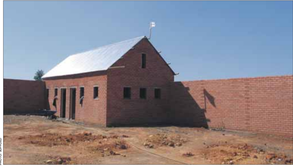
ABOVE: The maintenance sheds are almost complete.